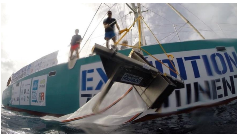
Collecting particles of plastic on the 7th Continent Expedition.