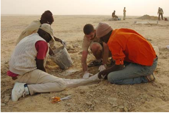
Excavation in the Djurab Desert (Northern Chad) by the MPFT team