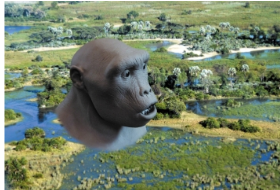
Sculpture(E. Daynes) and photo (Ph. Plailly) of Toumai seen against the landscape of the Okavango delta (Botswana). Photomontage by A. Garau del / MPFT