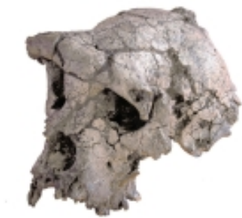
Toumai's cranium (original). Holotype of S. tchadensis