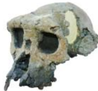
Stereolithographic cast of the 3D virtual reconstruction of Toumai's cranium