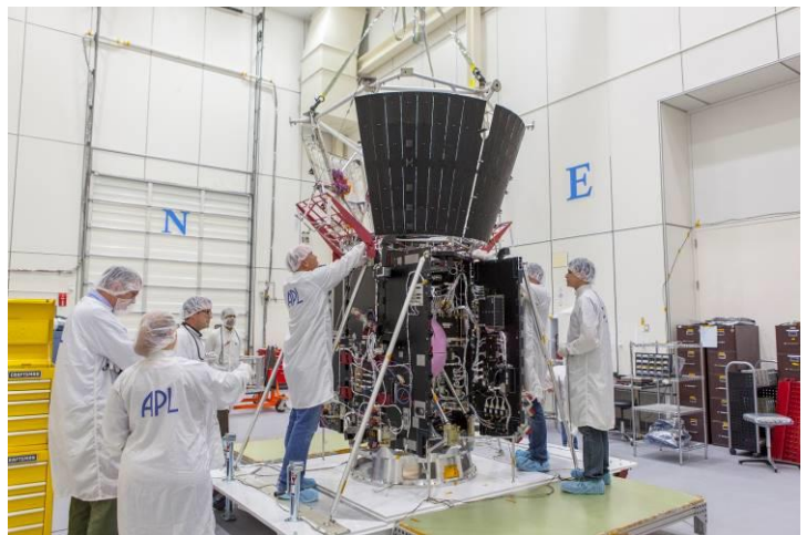
Assembly of Parker Solar Probe.