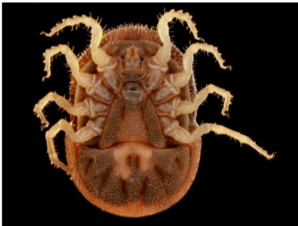
Ventral view of soft tick Ornithodoros moubata infected by symbiotic bacterium of genus Francisella