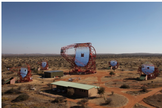
View of the HESS telescope array in Namibia

A better understanding of this diffuse light, which acts as a record of the Luminous Universe, provides information about the first stars, shedding light on their formation and on the evolution of galaxies. This new data could be incorporated into certain cosmological models to better describe the rate and processes of star formation since the birth of the Universe. These findings can also be used to define the size of the Universe observable in gamma rays, and open up the possibility of studying the signatures of more fundamental mechanisms related to intergalactic magnetic fields, as well as exotic physical phenomena.