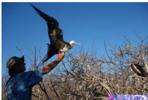
A juvenile frigate bird is released after being equipped with a tiny Argos transmitter

This study raises numerous questions regarding the capacity of frigate birds to sleep in flight and resist the extreme conditions encountered within cumulus clouds, as well as the strategy they use to avoid tropical cyclones in their path.