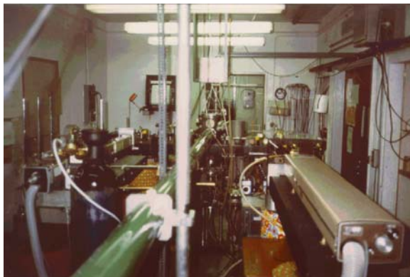
The experiment to test Bell's inequalities at Orsay (1982). The source of pairs of entangled photons consisted of several lasers, and a stream of atoms travelling into an atomic chamber which can be seen in the centre. Measurements were taken after they had travelled 6 meters in both directions from the source.

The quantum properties of pairs of entangled particles and of single photons are currently used to carry out operations involving secure data transmission by means of quantum cryptography . In these methods, the security of the transmission is guaranteed by the fundamental laws of quantum physics, rather than on the assumption underlying conventional methods of cryptography, namely that an adversary (the person who tries to decode the secret message) has a knowledge of mathematics or of information technology which does not go beyond the current state of the art. The phenomenon of entanglement also lies at the heart of research into quantum computers , whose processing power, if they are ever made, could be exponentially greater than that of conventional computers. This research into quantum information is likely to have a considerable impact on the field of secure data links, for instance on the Internet.